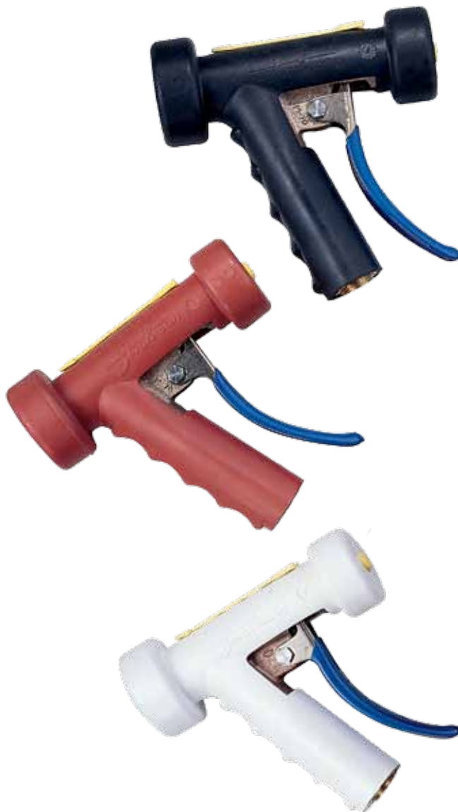
Shown: Red M-70 (black cover), M-75 (white cover), M-77 (red cover)

Please see reverse side for parts listing.