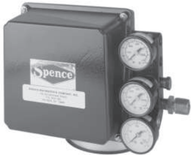
MOORE 760P PNEUMATIC POSITIONER