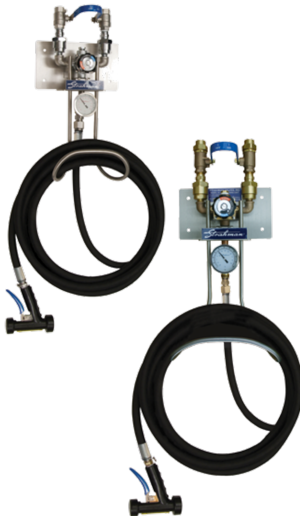
Shown (top left): Chrome-plated M-200TS unit; shown with premium hose assembly and 5-70 Series nozzle. Available (bottom right): M-200TS in bronze

Please see reverse side for parts listing.