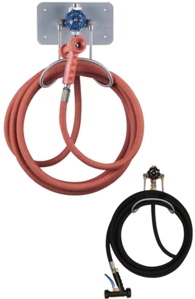
Shown above: M-756 with MP-88 mounting plate; shown with Strahman premium hose assembly and S-70 Series nozzle. Shown below: M-156N; shown with Strahman premium hose assembly and M-70 Series nozzle, available with MP-88 mounting plate.