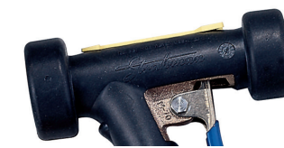
(20B) RUBBER COVER - BLACK