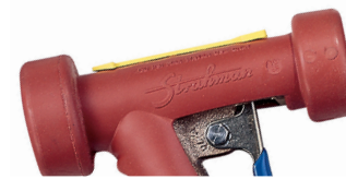
(20R) RUBBER COVER - RED