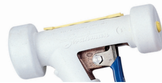
(20W) RUBBER COVER - WHITE