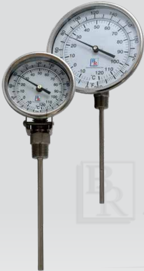
Model BR3A and BR5A Bi-Metal Thermometer Adjustable Angle Type